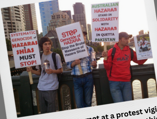
A group of students met at a protest vigil in Melbourne and decided to do something tangible and impactful.